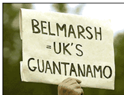
Protesters have made their views known

The detainees are unable to see the intelligence evidence against them and are confined to their cells for up to 22 hours a day. Their solicitors say they have been "entombed in concrete".