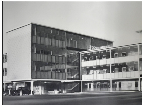
Secondary Modern School, Liverpool.