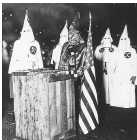
Klansmen wearing white masks

By 1867, the movement had spread throughout the small towns of the south. By 1869, however, there were problems among the Klansmen themselves and they began to fight each other. Many prominent people left the clan and the higher ranks were filled with criminals. Even Forrest left the organisation.