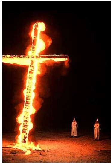
The Klan often set crosses on fire to frighten people

In 1915, the Klan was reorganised. At that time – it was the time of World War I – immigration was a great challenge: many Catholics and Jews immigrated to the United States. The Klan promised to defend the home front against “alien enemies, slackers, idlers, strike leaders and immoral women,” as well as African Americans, Catholics and Jews. As a result they attracted many new members. The hypocrisy of a self-proclaimed “law and order” organisation was obvious. Again the leaders among the Klansmen fought each other and soon the organisation collapsed into several small groups.